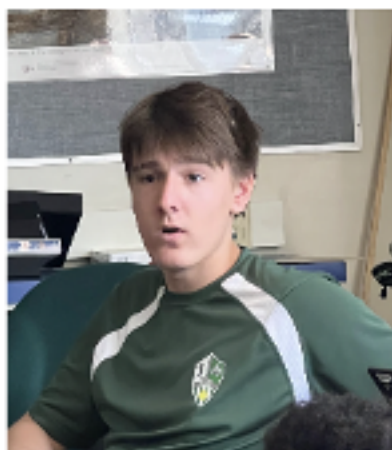
"A random guy came up and tried to talk to me" - Wes Z