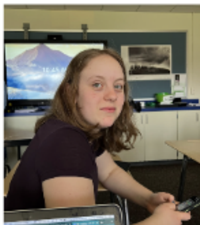
"I witnessed an old guy pass out in an ice cream shop and his head started bleeding" - Klara BS